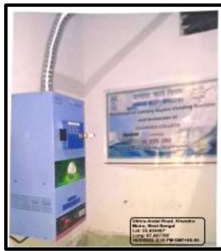
IMAGE OF WATER-PURIFIER